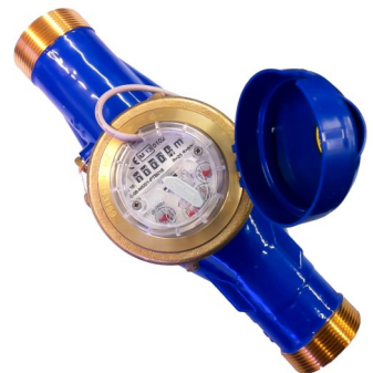
Water Meter Controlled