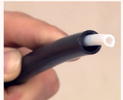
Double Walled Tubing